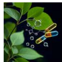
Diabetes care products