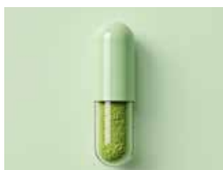
Functional food additives