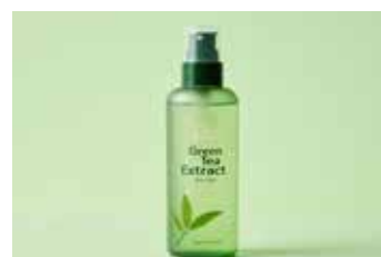
Cosmetics & personal care