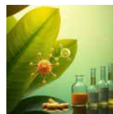
Blood glucose management products