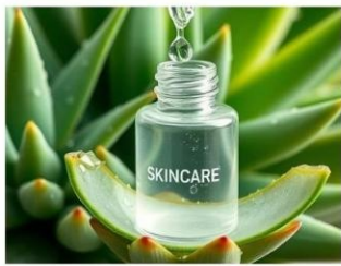
Skincare & Cosmetics